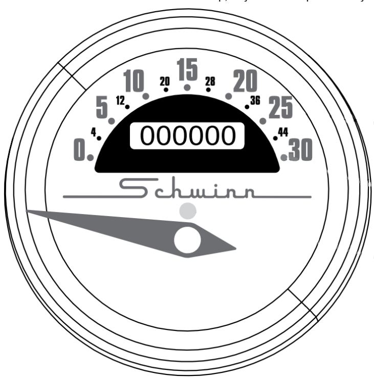
The speedometer (numbers above odometer reading) should be lit up if properly powered.